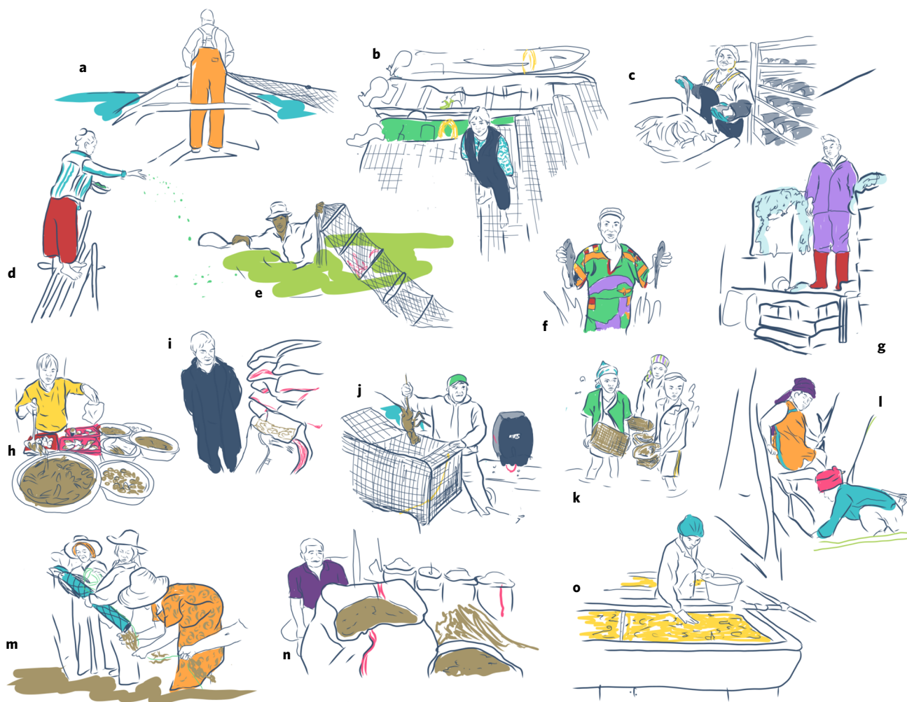
Fig. 1 | Profiles of 15 small-scale actors selected as examples from 70 case profiles representing producers from marine and freshwater fisheries and aquaculture, traders and processors across diverse geographies and demographics. a, Inland Canadian lake-fisher and retail entrepreneur channelling catch to domestic and US markets (Supplementary Table 2, #SSFA-8). b, Rural Chilean fisherwoman targeting multiple species, including benthic gastropods, in a collective territorial user rights system (#SSFA-10). c, Processing plant worker from a fishing cooperative in Baja California, Mexico (#SSFA-45). d, Monosex Nile pond tilapia farmer in Myanmar (#SSFA-53). e, Mangrove integrated organic shrimp farmer in Vietnam (#SSFA-65). f, Pluriactive Zambian crop farmer and fisher, who is also a new fish farmer (#SSFA-67). g, Middleman in Guangdong province, China (#SSFA-17). h, Chinese businesswoman buying a variety of species wholesale to sell to Shanghai residents (#SSFA-18). i, Feed producer for the commercial tilapia aquaculture sector in Kenya (#SSFA-32). j, Lobsterman, finfish and shark fisher from a cooperative in Mexico, geared towards the tourist-based commercial market (#SSFA-47). k, Child gleaners in Madagascar use handwoven baskets to collect freshwater shrimp, crabs and small fish (#SSFA-42). l, Indigenous i-Taukei (Fijian) fisherwomen collect mud crabs from mangroves (#SSFA-23). m, Women seaweed farmers using tubular net technology in Zanzibar, Tanzania (#SSFA-59). n, Market trader of dried fish in Myanmar's coastal Ayeyarwady region (#SSFA-52). o, Shellfish processor supplying yellow clams to the Uruguayan luxury restaurant market (#SSFA-60).

SSFA actors show important differences in the possibilities for diversification. In general, diversification can grant flexibility to an individual's operations, securing them against certain risks and enabling adaptability, as recently demonstrated by responses to the COVID-19 pandemic 49 . Flexibility to move between occupations can also provide conditions that support adaptive responses 26 . However, diversification is not always a positive characteristic; it may be an outcome of necessity rather than opportunity 27 . Efficiency or consolidation may be effective in certain operations and contexts, such as processing of high-value resources or transportation logistics. Furthermore, diversification should not undermine the importance of value-chain coordination, much of which is informal within private-sector networks.